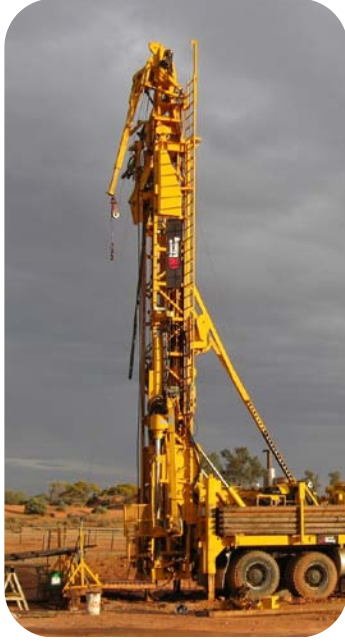
Diamond drilling at TKHD1A.