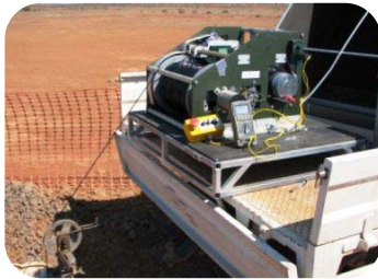
Vehicle mounted thermister.