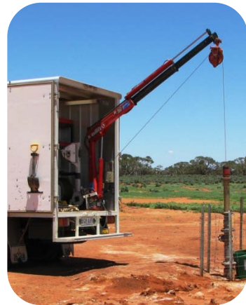
Government logging equipment.